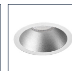
Silver reflector 4606675