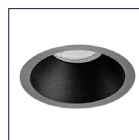
Black reflector 4606668