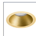
Gold reflector 4606842