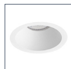
White reflector 4606651